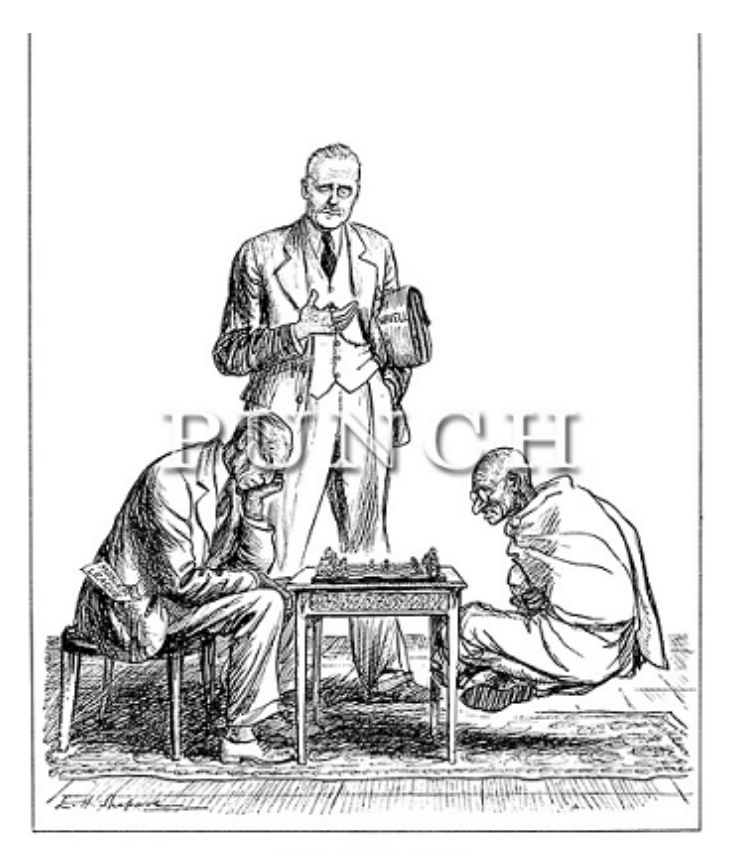
TIME FOR A MOVE