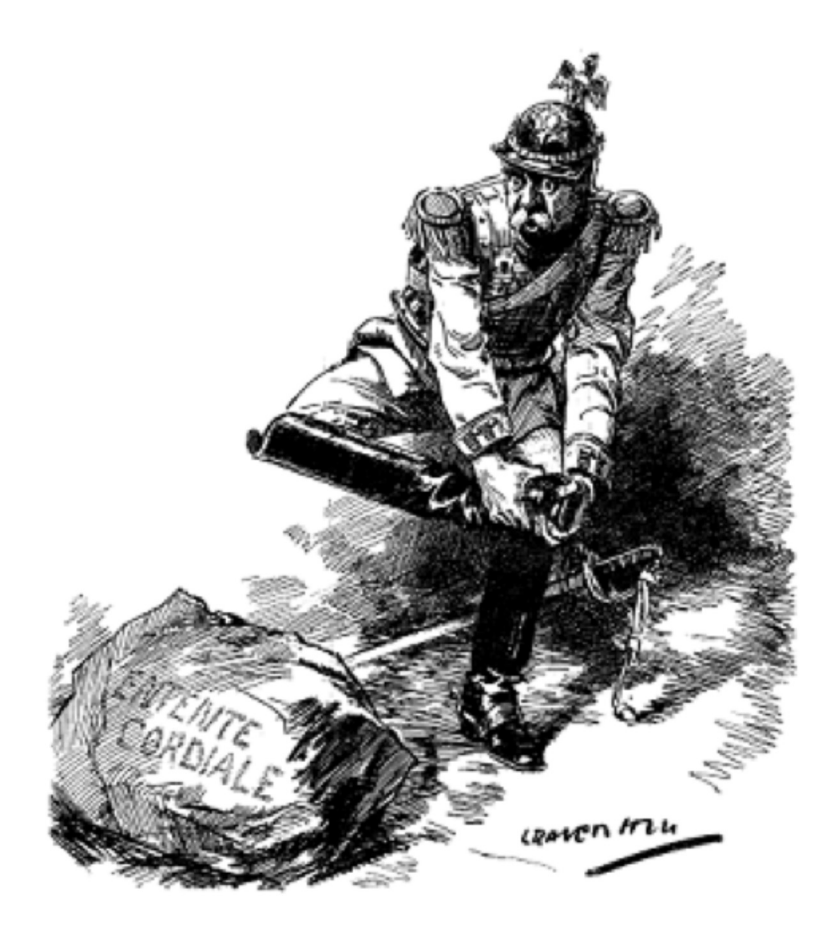
A British cartoon, entitled 'Solid', published in August 1911. The Kaiser is saying 'Donnerwetter! It's rock. I thought it was going to be paper.'