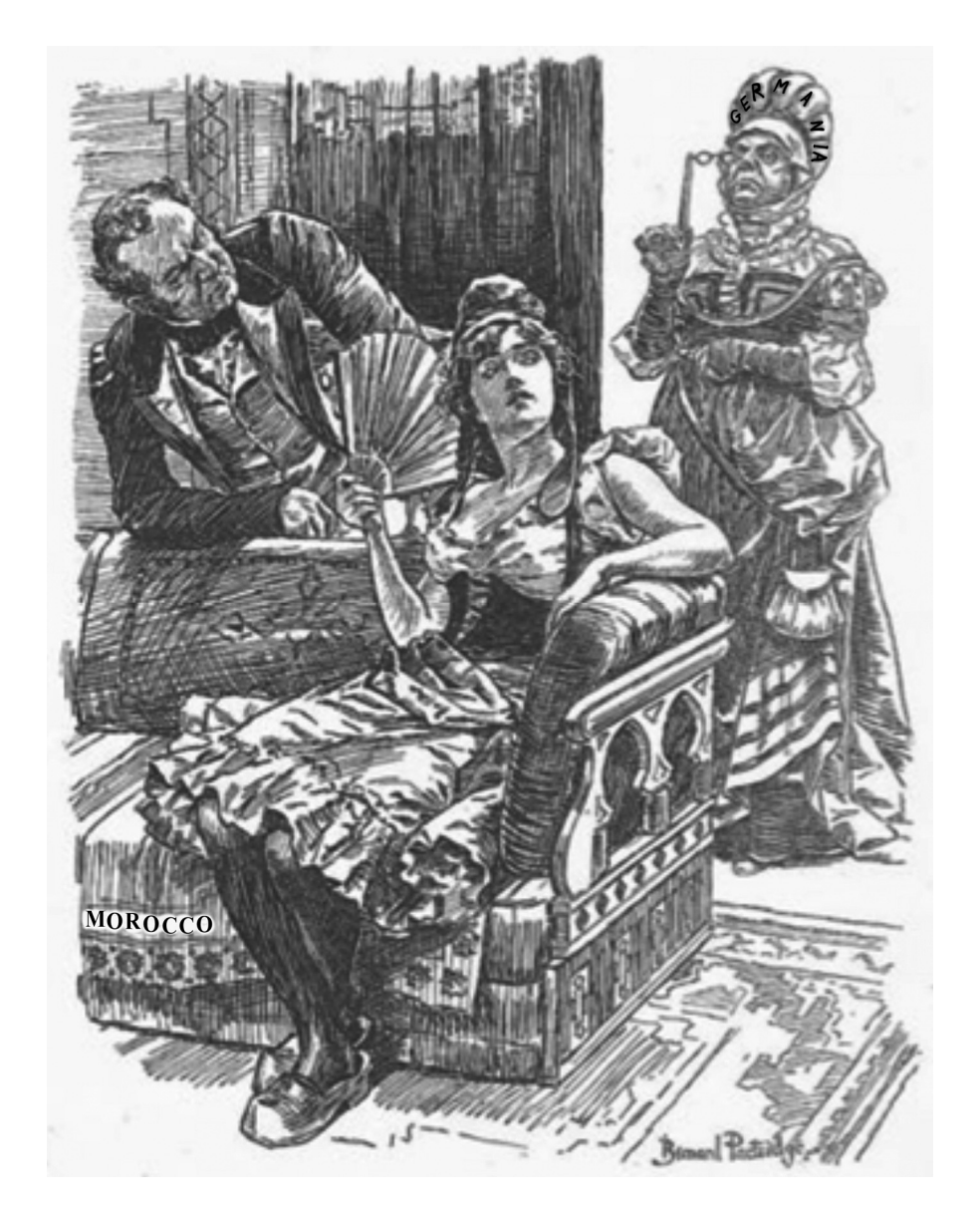
A British cartoon published in April 1905. Its title is 'The Matchmaker, despite herself.' The French woman sitting says to Britain, 'If she's going to glare at us like that, it almost looks as if we might have to be properly engaged.'