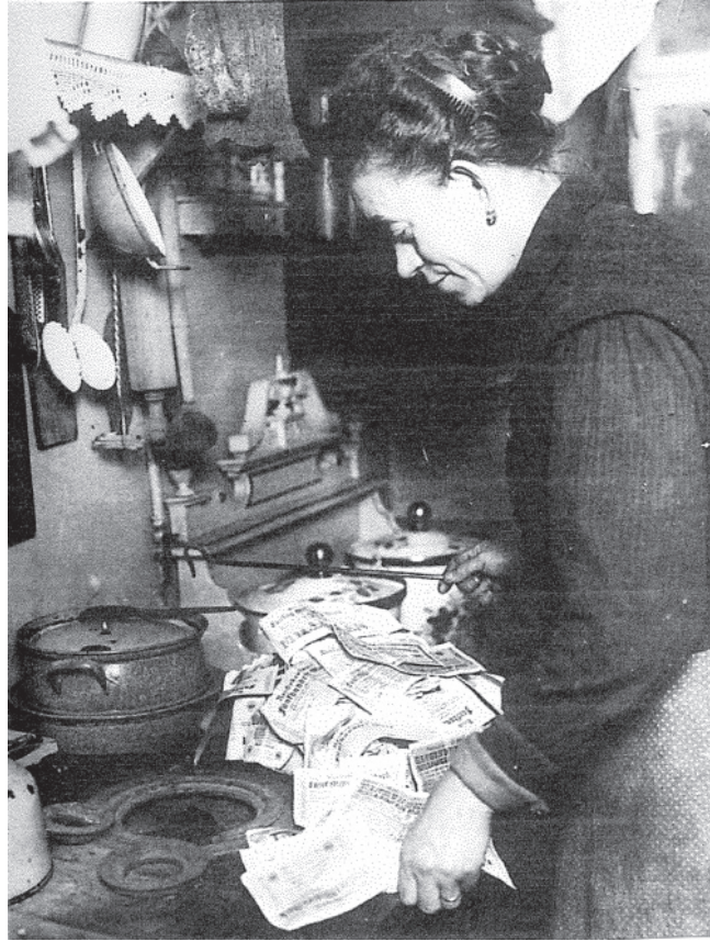
A woman using banknotes to start her fire in 1923.