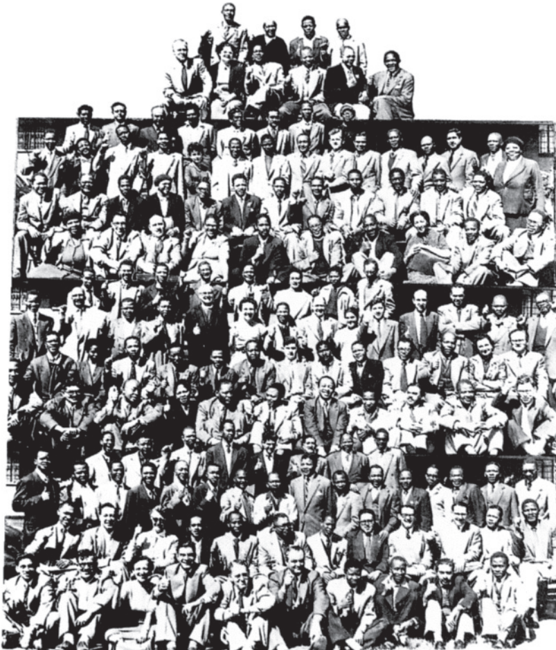
The accused at the start of the Treason Trials, December 1956.

18 Study the photograph, and then answer the questions which follow.