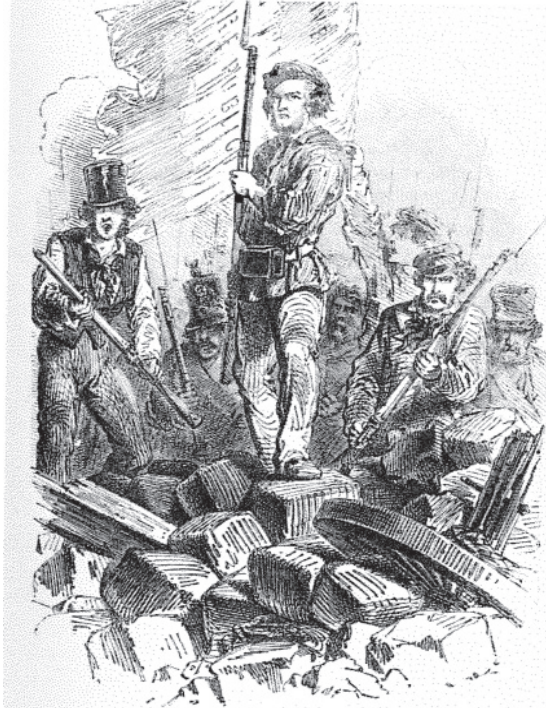
Paris during the 'June Days', 1848.