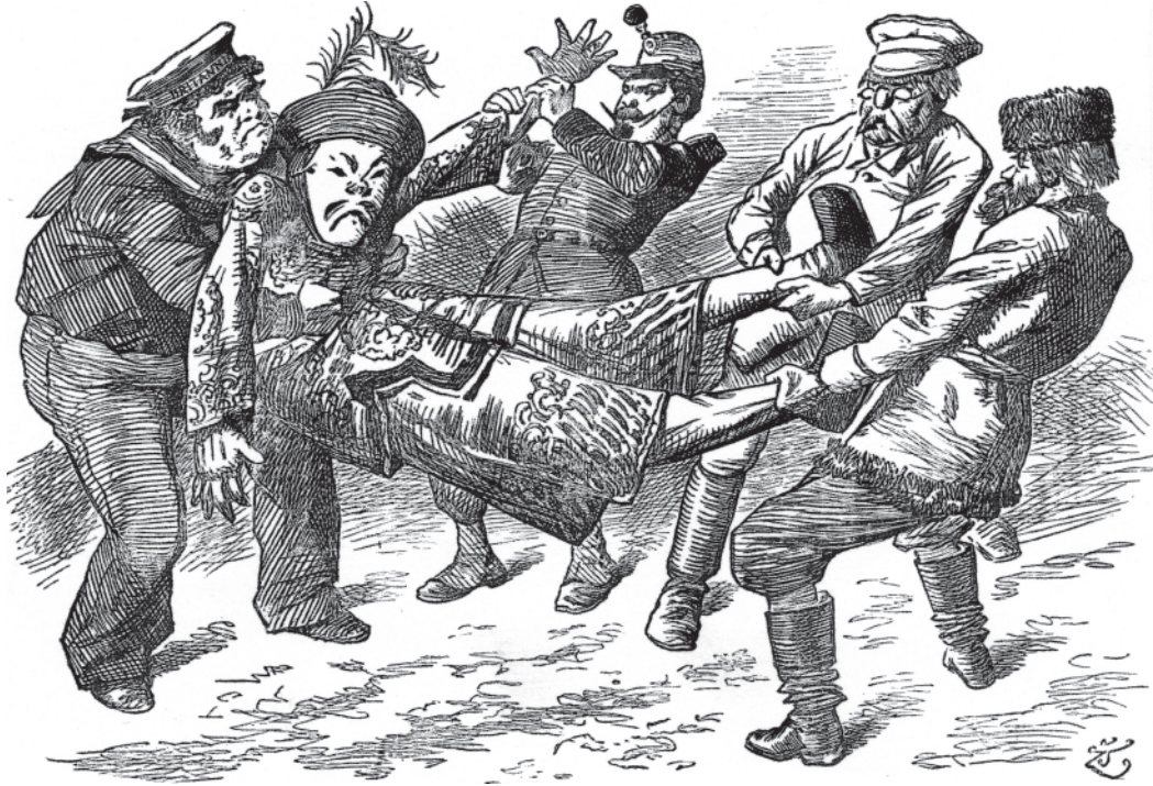
A cartoon showing foreign countries competing over China.

24 Study the cartoon, and then answer the questions which follow.