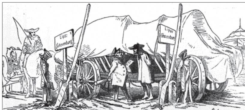
A German cartoon showing the collection of customs duties in 1834.