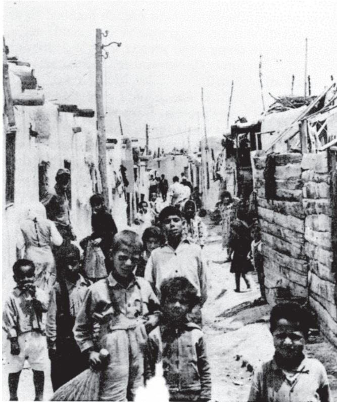
A street in a Palestinian refugee camp in 1966.

21 Study the photograph, and then answer the questions which follow.