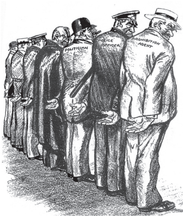
A cartoon from the Prohibition era entitled 'The National Gesture'.

13 Study the cartoon, and then answer the questions which follow.