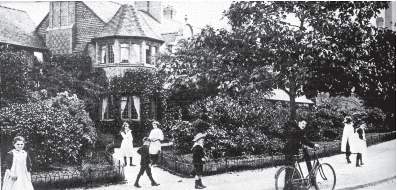
Workers' cottages built by Lever in the model village of Port Sunlight.

23 Study the photograph, and then answer the questions which follow.