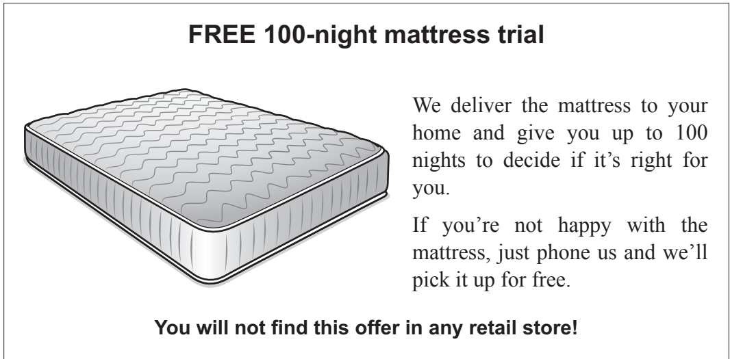
Fig. 5.1 Sales promotion

5 The sales promotion in Fig. 5.1 is advertised in a local newspaper.