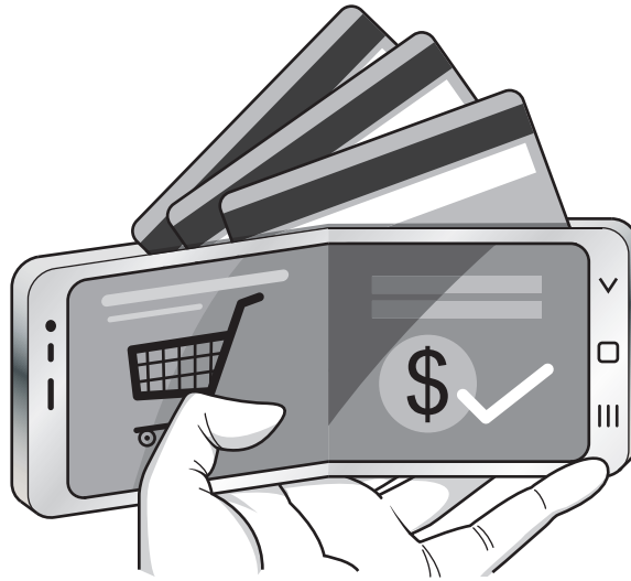
Fig. 3.1 Electronic transfer of money

Use Fig. 3.1 to help you answer the following questions.